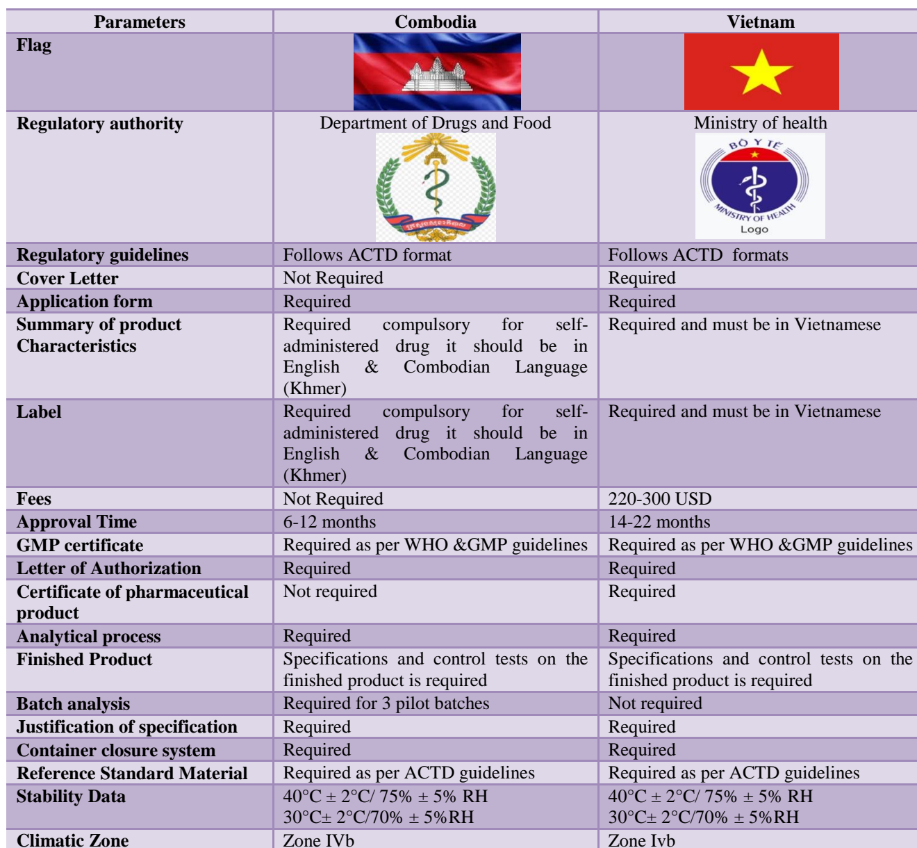
Table 1. Comparison of registration requirements