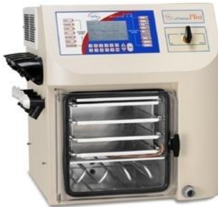
Figure 2: A bench top freeze dryer, front view, showing control wizard, shelf and internal condenser