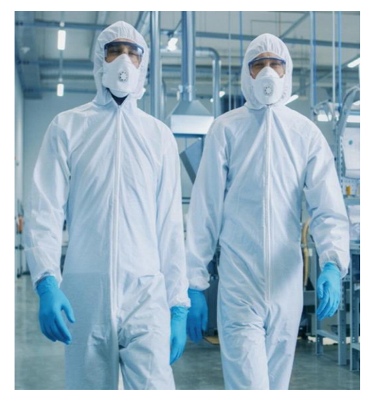
Figure 3. People at work with secondary gowning. (13)